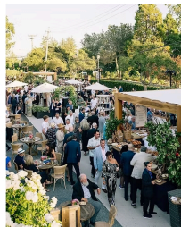
OUT AND ABOUT Wine Walks + Culinary Nights: Could Outdoor Dining Be The Ultimate Luxury?