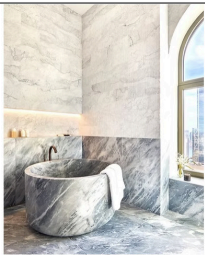
EYE ON DESIGN

Striking Gold: Retro Hunting And Where To Shop Couture And The Best Vintage.