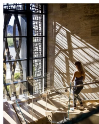
LOVE YOUR LOOK Vibe Shift: A New Perspective On The Incredibly Luxurious Desert Lifestyle At Ascaya.

It's how they find what's next on the agenda. They scan. They step into your world. They experience your expertise, your standards, your vision. Not just what you offer— But how you think, what you value, and why it matters. This is where curiosity turns to certainty.