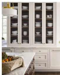
EYE ON DESIGN A New Wave Of Kitchen Design Disruptors: Flipping The Script And The Floorplans.