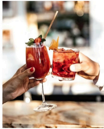
THE LATEST DISH

Bathed In Grandeur: Indulge Where Sculptural Form Meets Function—And Pure Pleasure.