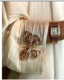
SHOPS THAT SHINE

What's In A Name? When It Comes To Champagne, Maybe Everything—Prestige, Bubbles, And Bragging Rights.