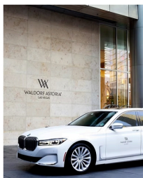
LOVE YOUR LOOK A Glimpse Inside The Ultra-Cool Sanctuary Above The Strip: The Spa At Waldorf Astoria.