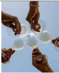
THE LATEST DISH

What's In A Name? When It Comes To Champagne, Maybe Everything—Prestige, Bubbles, And Bragging Rights.