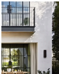
AT YOUR SERVICE Marketplace Agenda: The Incentives Shaping Our Tastes & Topping Our Lists.