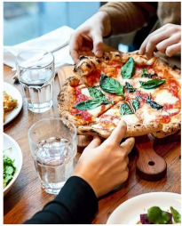
THE LATEST DISH

Well-Kept, Well-Curated: The Local Tastemakers Quietly Defining The City's Style Scene.