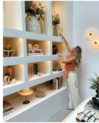
SHOPS THAT SHINE

The Happiest Place: Top Places To Celebrate A Lavish Big Birthday In Vegas.